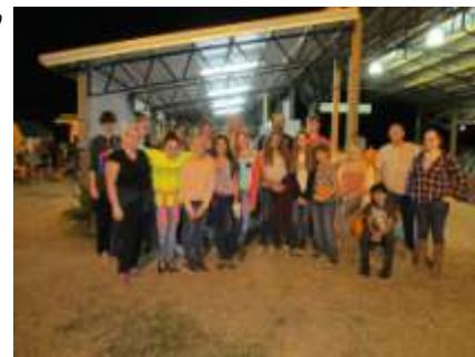
Our youth group had a wonderful time at Sykes and Cooper Farms!

Sykes and Cooper Farms’ corn maze is actually cut into sorghum. According to the event website ( www.sycofarms.com ) sorghum is “a crop used primarily for cattle feed. Sorghum looks similar to corn but does not actually have corn cobs on it. The reason sorghum is used instead of corn is because it is stronger and more tolerant to Florida’s unpredictable weather.” Honestly, we couldn’t tell the difference!