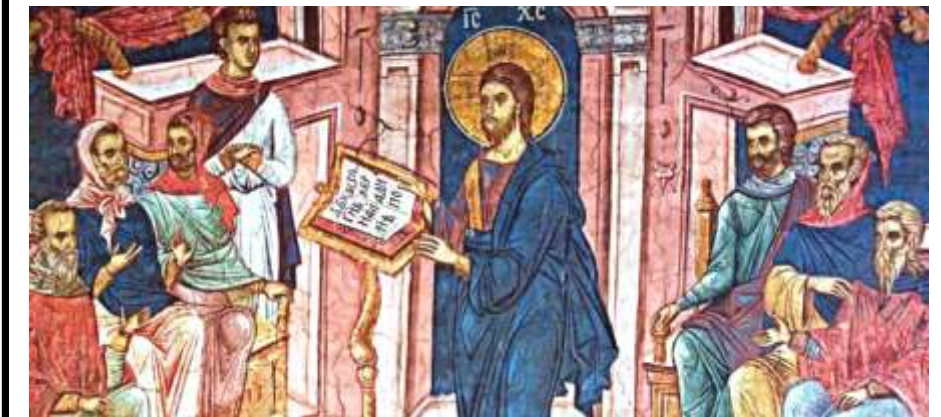
Jesus reading from Isaiah in the synagogue

To all who enter here—to those who are weary and need rest, who mourn and need comfort, who sin and need a Savior, who rejoice and wish to praise, who are blessed and wish to serve— this Church opens wide the door and says in the name of our Lord Jesus Christ, WELCOME.