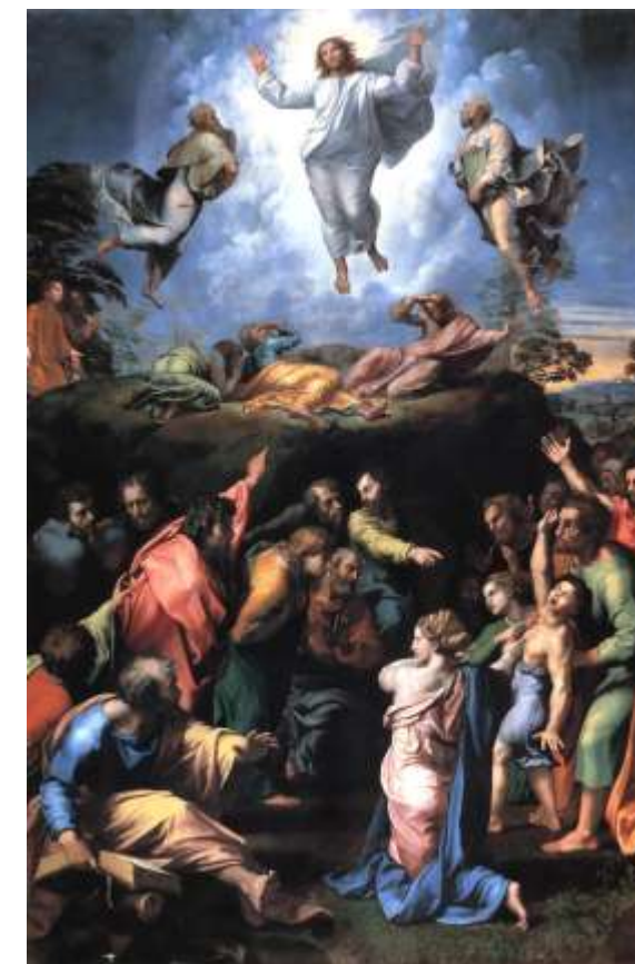
The Transfiguration , Raphael, 16th c.

To all who enter here—to those who are weary and need rest, who mourn and need comfort, who sin and need a Savior, who rejoice and wish to praise, who are blessed and wish to serve— this Church opens wide the door and says in the name of our Lord Jesus Christ, WELCOME.