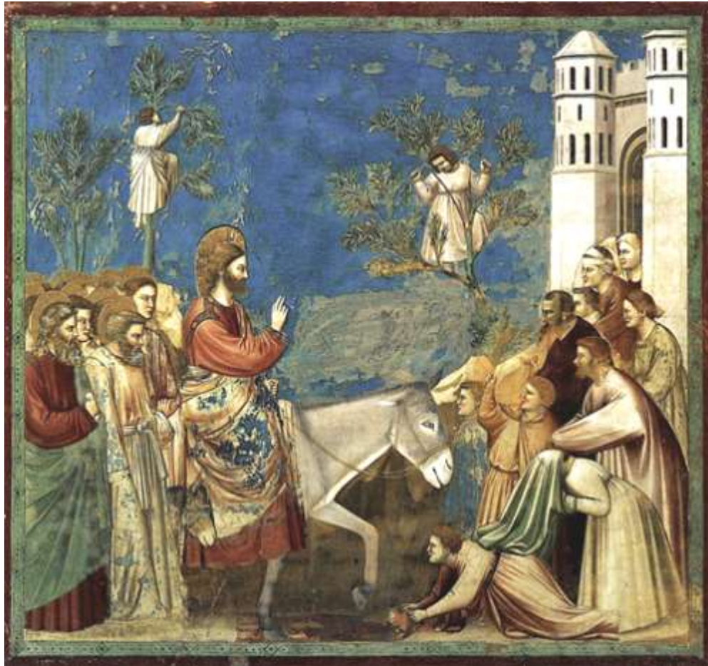
Christ enters Jerusalem, Giotto, 14th c.