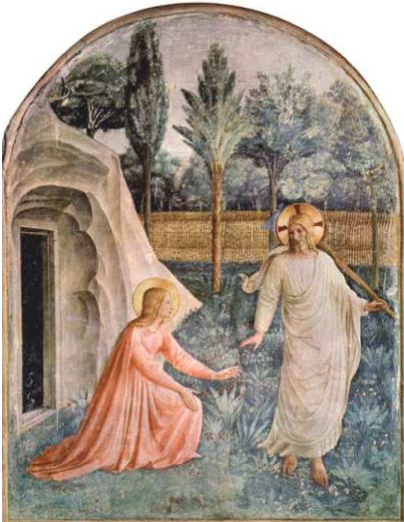
"Noli Me Tangere" by Fra Angelico, 15th c.