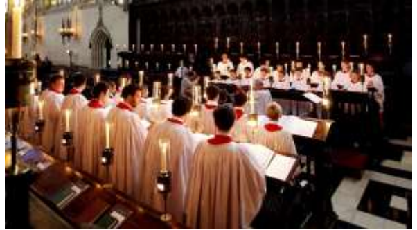
The Festival of Nine Lessons and Carols at King's College, Cambridge

Every New Year's Eve at St. John's Cathedral, we have a long annual tradition of offering one of the most beautiful Christmas services in the Anglican tradition, the Festival of Nine Lessons and Carols. This service is a journey in music and scripture through the story of salvation: the fall of humanity, the promise of the Messiah, and the birth of Jesus. The service consists of nine short Bible readings, interspersed with the singing of Christmas carols, hymns and choral music.