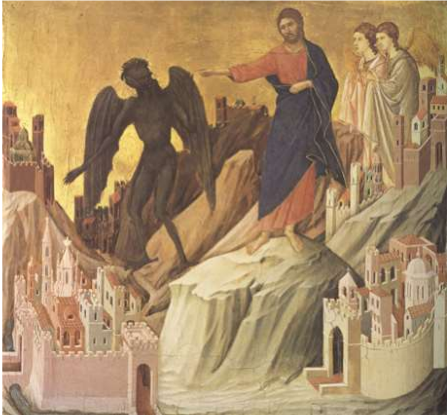
Duccio, The Temptation of Christ , early 14th c.