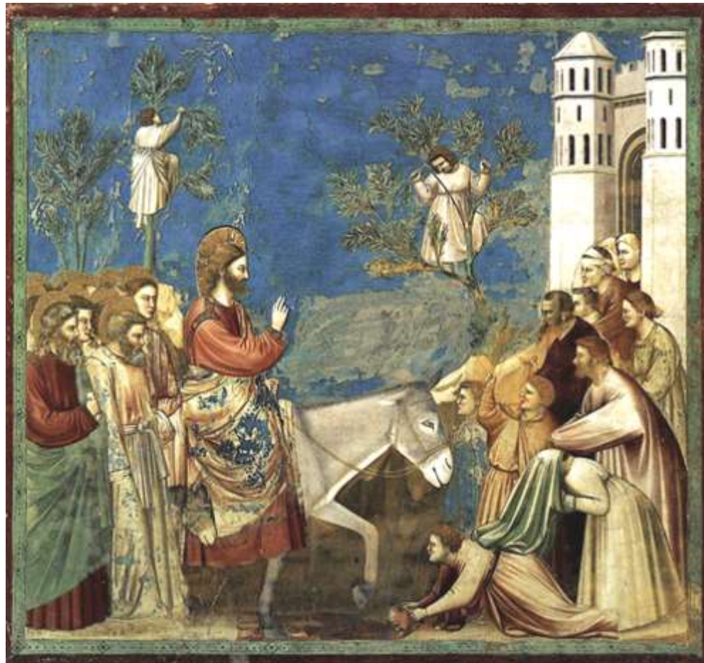
Christ enters Jerusalem, Giotto, 14th c.