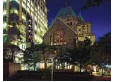
Christ Church Cathedral Vancouver, British Columbia