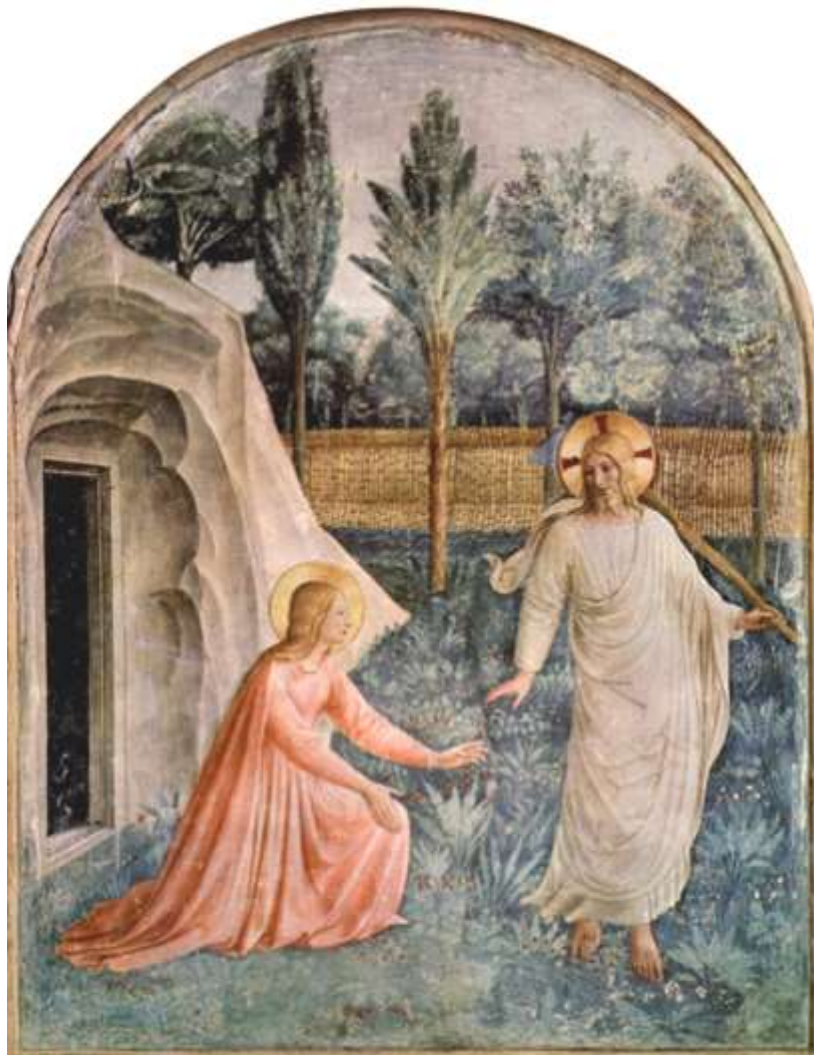
“Noli Me Tangere” by Fra Angelico, 15th c.