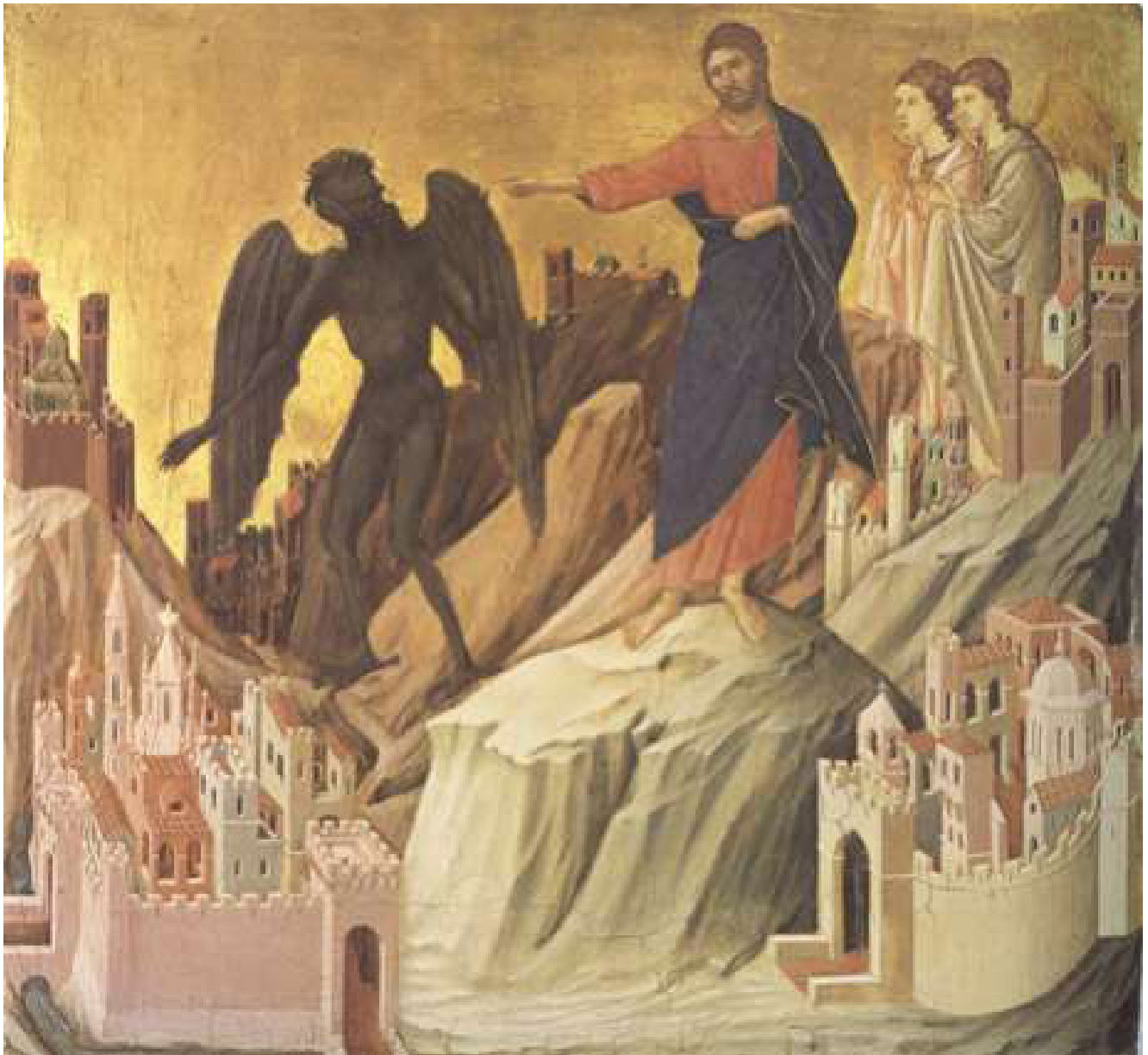
Duccio, The Temptation of Christ, early 14th c.