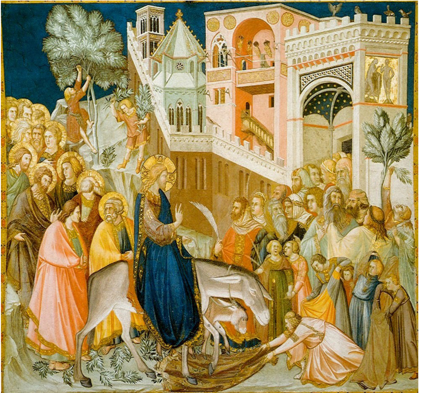
Entry of Jesus into Jerusalem, Pietro Lorezetti (circa 1320)