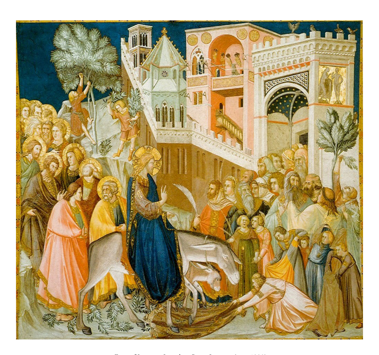
Entry of Jesus into Jerusalem, Pietro Lorezetti (circa 1320)