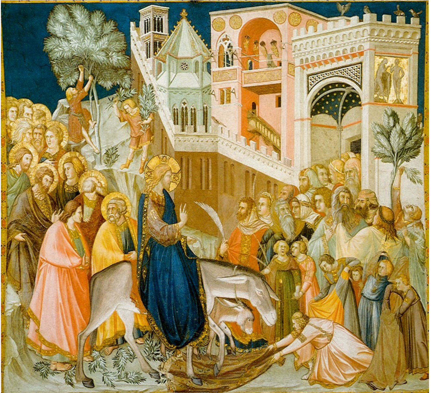
Entry of Jesus into Jerusalem, Pietro Lorezetti (circa 1320)