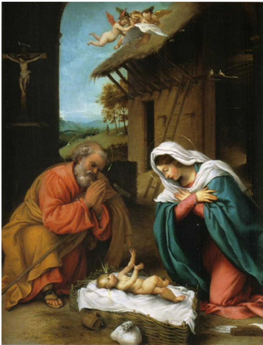
Lorenzo Lotto, The Nativity, 16th c.