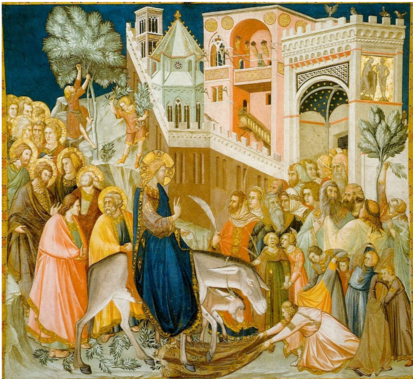
Entry of Jesus into Jerusalem, Pietro Lorezetti (circa 1320)