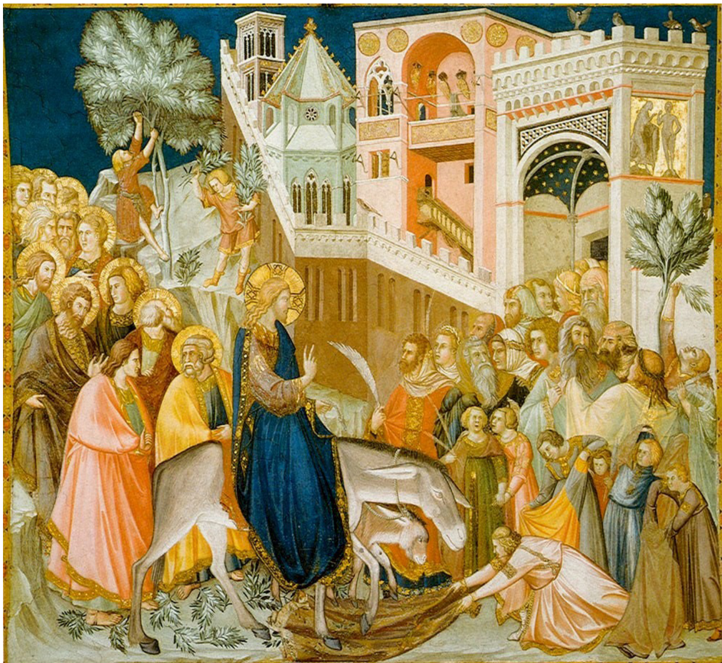
Entry of Jesus into Jerusalem, Pietro Lorezetti (circa 1320)